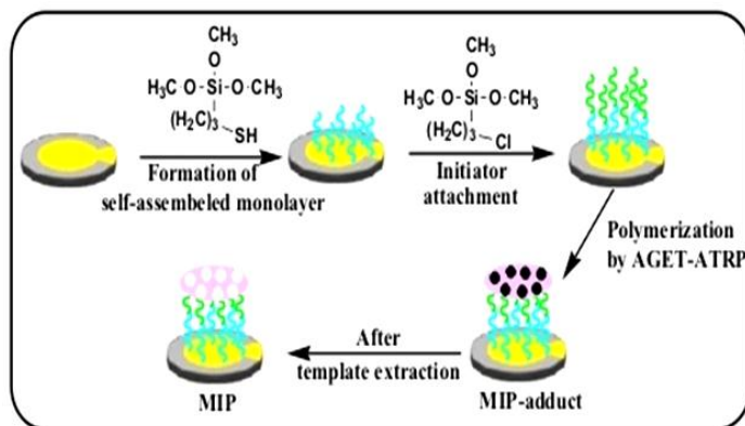
Fig. 1. Fabrication of MIP-modified QCM sensor using a surface grafted initiator.

Morphological images were recorded using scanning electron microscope (SEM, JEOL, JSM, Model 840A, Netherlands).