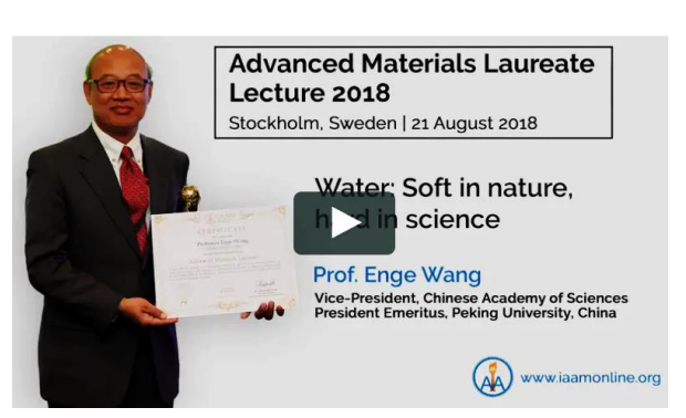
Fig. 3. Watch <u>Advanced Materials Laureate Lecture 2018</u> (Video recorded by IAAM media), delivered by Prof. Wang on 21 August 2018 at Stockholm, Sweden.

In his Laureate talk, Prof. Wang summarized that "Despite water being a ubiquitous substance, it is surprising that some basic questions are still debated. Here, using a combination of experimental (cryogenic STM) and theoretical (first-principle electronic structures and molecular dynamics) methods, we systematically studied the unusual structure and dynamics of ice surface at atomic scale, and the submolecular imagining, clustering and proton transfer mechanisms of water on salt. First, an order parameter, which defines the ice surface energy, is identified. We predict that the proton order-disorder transition, which occurs in the bulk at ~72 K, will not occur at the surface at any temperature below surface melting. In addition, we find that the surface of crystalline ice exhibits a higher than expected concentration of vacancies at the external layer that may contribute to the phenomenon of pre-melting and quasi-liquid layer formation. Second, a STM molecular imaging mechanism based on a subtle control over the tip-molecule coupling is proposed, which allows a sub-molecular level resolution for water. A concerted proton tunneling mechanism is studied within the water tetramer, which is the basic unit to form an extended 2D ice layer by bridging water molecules on NaCl (001). These results shed light on our understanding of water at atomic scale" (Fig. 3).